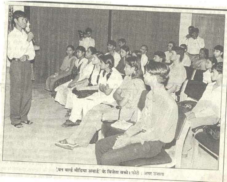
'वन वर्ल्ड मीडिया अवार्ड' के विजेता बच्चे।