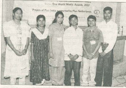
ಚಿತ್ರ ತಯಾರಿಸಿದ ಎಚ್.ಡಿ. ಕೋಟೆ ತಾಲ್ಲೂಕಿನ ಮಕ್ಕಳು

'ಪ್ಲಾನ್ ಇಂಡಿಯಾ' ಎಂಬ ಸ್ವಯಂಸೇವಾ ಸಂಸ್ಥೆಯ ಸದಸ್ಯರು ಮಕ್ಕಳಿಗೆ ಚಿತ್ರ ನಿರ್ಮಾಣದ ಬಗ್ಗೆ 20