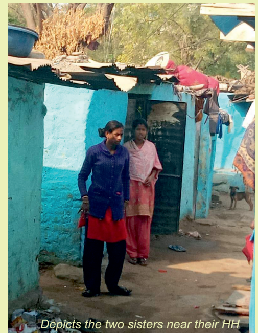
Depicts the two sisters near their HH