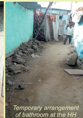
Temporary arrangement of bathroom at the HH