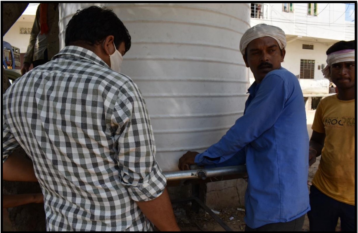
PHED Workers install the tank

Mr. Hemraj subsequently visited the zonal level PHED office and discussed the same with the J.E of PHED, North for restoration of water tanks.