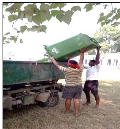
Drain desilting by BMC

With many processes gaining momentum and the active members of the just-evolving-CMC beginning to shape community engagement, we decided to formally constitute CMC across 20 settlements