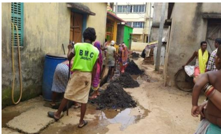
Waste being cleared